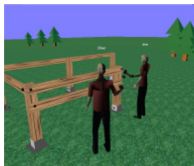
Figure 1. Virtual Gazebo